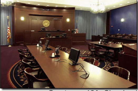
Courtroom 16A, Cleveland

Realtime transcription from the court reporter can be directed to monitors at the Judge's bench and counsel tables, with prior arrangements with the court reporter