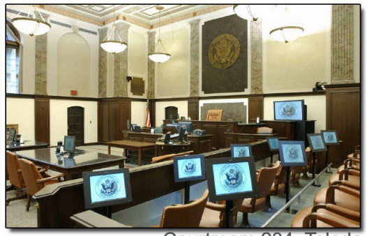
Courtroom 204, Toledo

A camera with pan, tilt, and zoom capabilities and a mounted camera at the witness box can also be accessed. This equipment can be used for remote witness testimony, pretrial conferences or other court proceedings